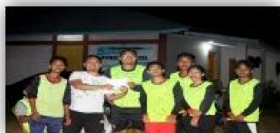
Annual Games & Sports