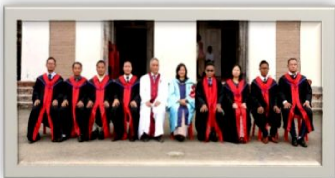
Faculty Shalom Theological Seminary

Address Shalom Theological Seminary S. Lhangnom, Sapameina, Kangpokpi District, Manipur – 795107 +91 9089593092 (Principal) +91-8415934372 (Academic Dean)